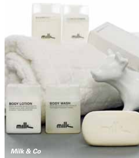
Milk & Co